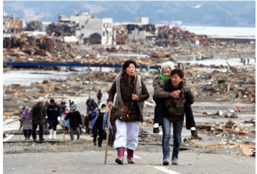
Survivors leave Tohoku a day after the March 11, 2011 earthquake and tsunami.

In Disaster Recovery, Social Networks Matter More Than Bottled Water and Batteries